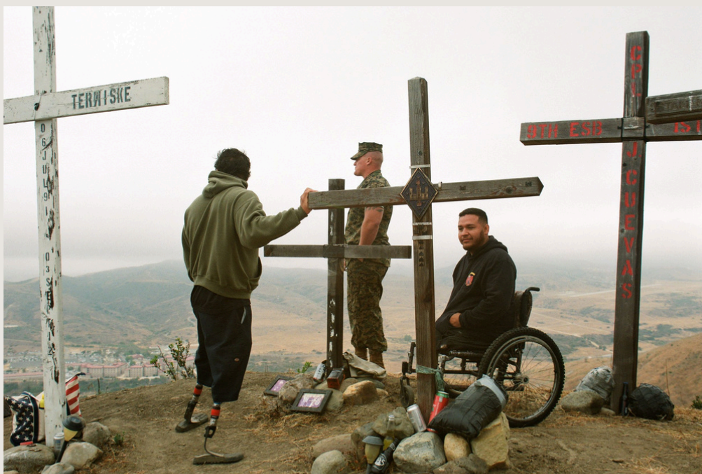
MARINES GATHERED ATOP FIRST SGT'S HILL, CAMP PENDLETON, CA