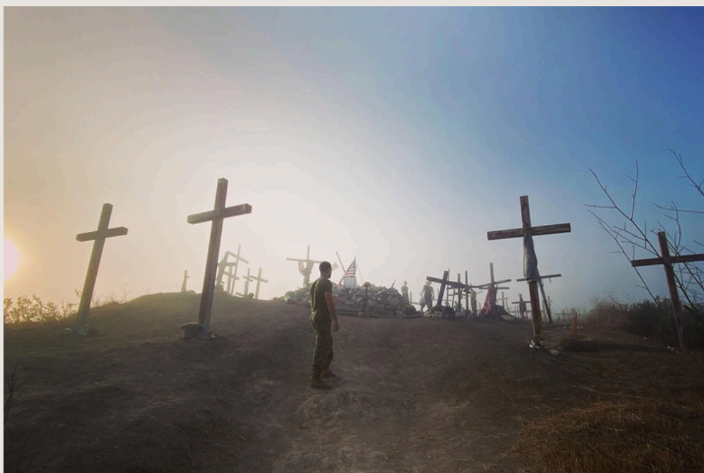
A MARINE STANDS AT THE SUMMIT OF 1ST SGT'S HILL, CAMP PENDLETON, CA.